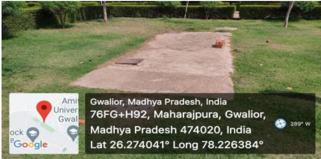
Rain Water Harvesting System A Block