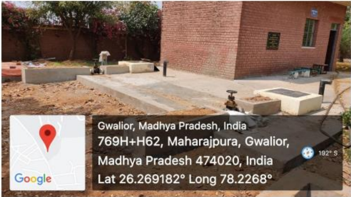
Tanks Behind C Block