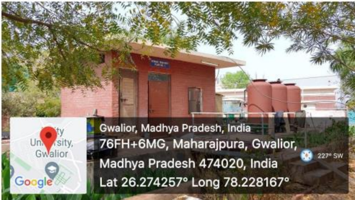
Waste Water Recycling System Near Hostel Crossing